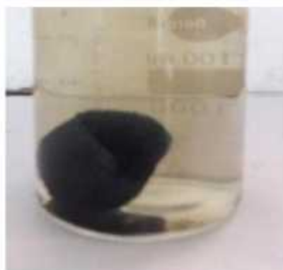
\text{Fe}_3\text{O}_4 Nanoparticles decorated with quantum Dots for targeted imaging in Biological system