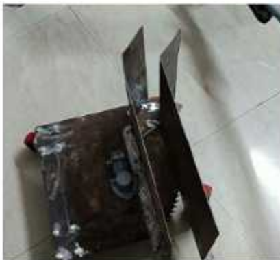
Design and Fabrication of Rice Crop Cutter