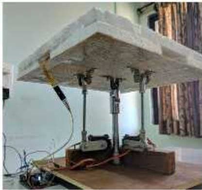
Development of Ball on Plate Balancing System