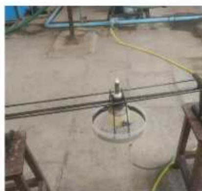
Low-Cost Cleaning Solution for Solar PV Panel