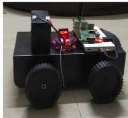
ROS based Robotic System for precision Farming