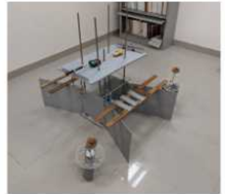
Vertical Axis Hydraulic Turbine