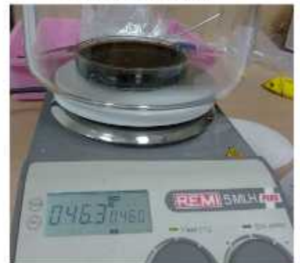
Graphene-based Nano- composite for supercapacitor application