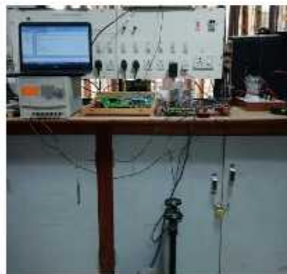
Implementation of Impedance-source Inverter (ZSI)