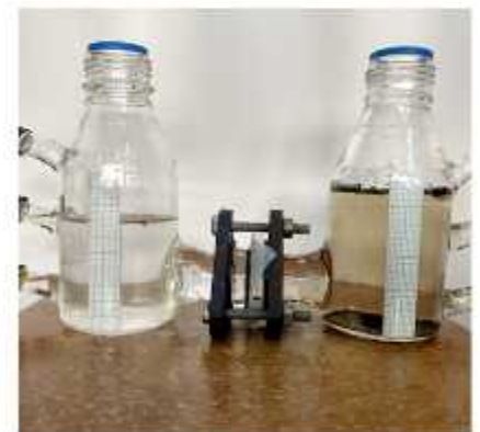
Plant Leaves based Waste Water Treatment