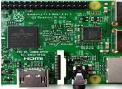
Real-Time Sign Language Recognition System Using Machine Learning