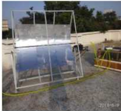
Solar Thermal- Parabolic Trough with active tracking