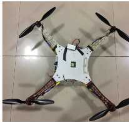
Development of Nonlinear Control System for Autonomy of Quad-Rotor